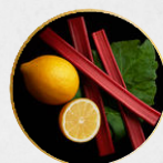
Soin de saison