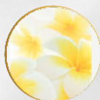
Fleur d'oranger & bois de cèdre