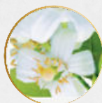
Citron & petitgrain

Choose your ideal texture (Nourishing oil, Soft and lush cream, or Melting wax) and your perfume of choice.